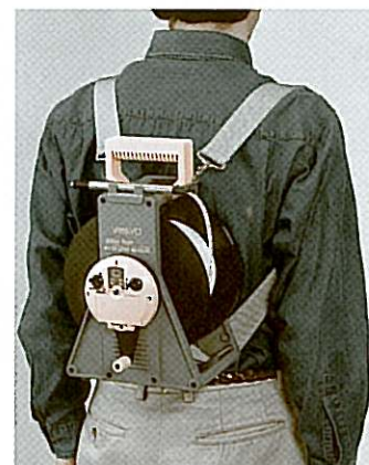
You can use optionally supplied belts on your back for your easy moving.